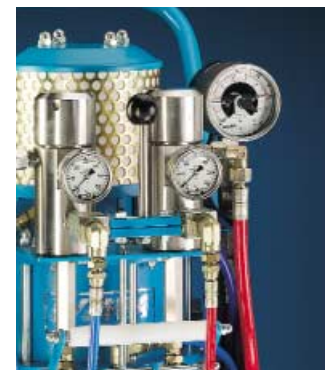
Pump with metering control