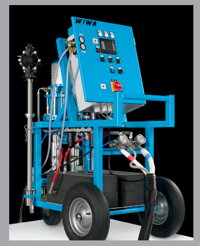
WIWA PU 460 Polyurea Systems