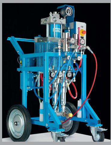
WIWA POWERPACK XXL 2K Hydraulic Systems