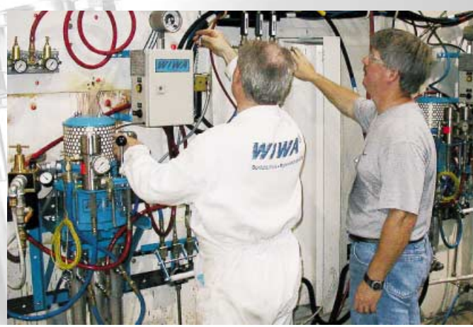
Commissioning a WIWA DUOMIX system in the United States