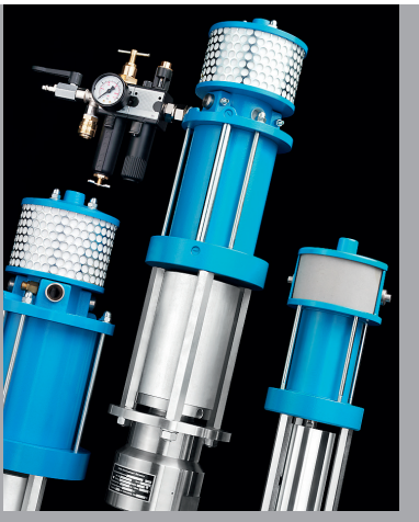
WIWA Fluid Transfer Pumps for diverse applications