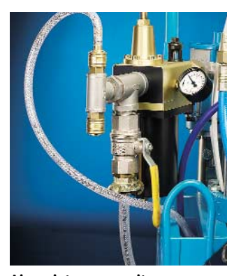
Air maintenance unit