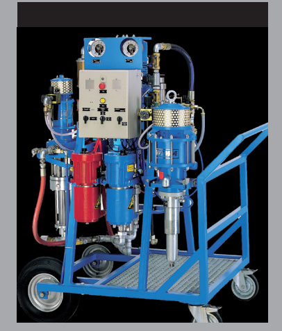
WIWA DUOMIX Plural Component Airless Paint Spraying Equipment