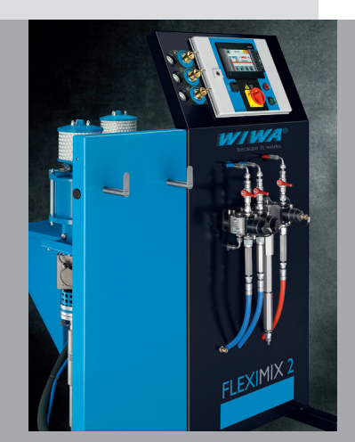
WIWA FLEXIMIX Electronic 2K Paint Spraying and Coating Equipment