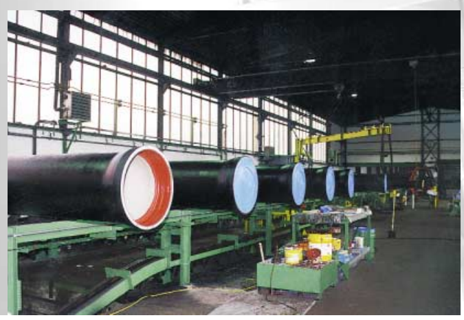
Internal and external pipe coating