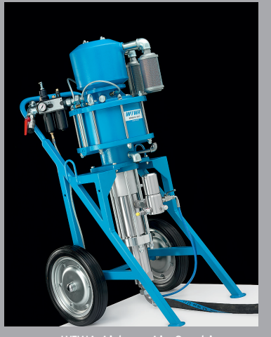
WIWA Airless, Air-Combi and Hot Spraying Systems