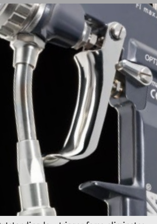
Outstanding low trigger force eliminates arm fatigue. Convenient external adjustable needle sealing.